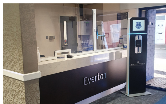
Tour Entrance, Main Reception desk