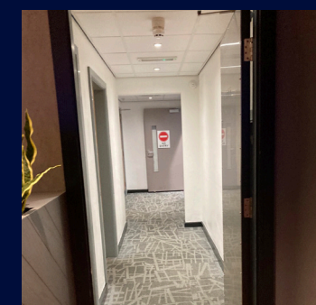
Entrance to Media corridor