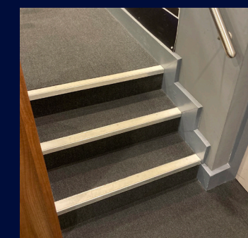
Steps to the media stage