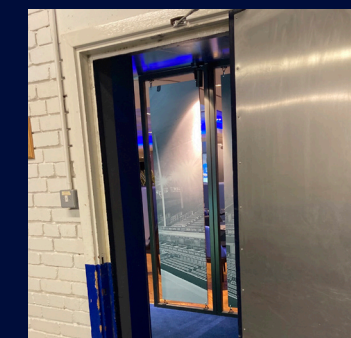
Entrance to 1878 lounge