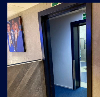
Exit of '85 lounge