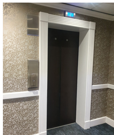
Main Entrance Lift