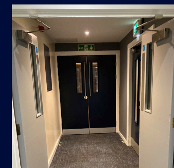
Entrance to '85 lounge