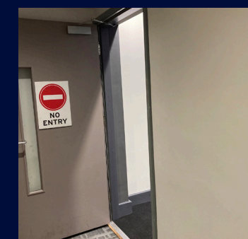
Entrance to Media room